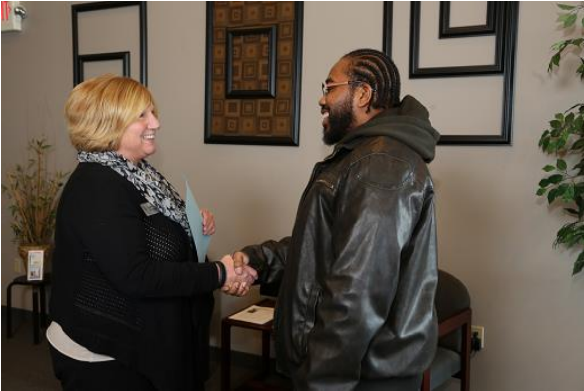
Sandusky (Branch Campus)