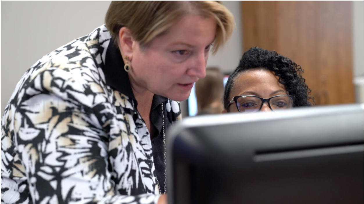
Sandusky (Branch Campus)