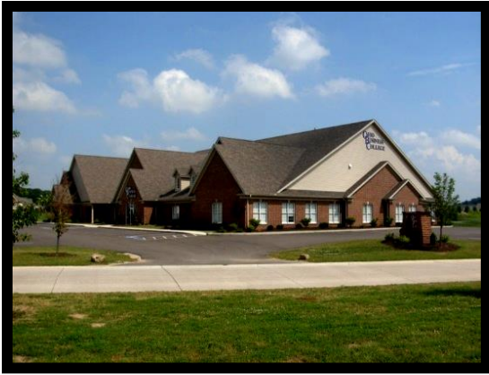
Sheffield Village (Main Campus)