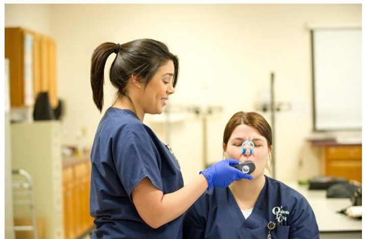
Sandusky (Branch Campus)

From the first day of attendance to the last, all students must be in compliance with dress code requirements.