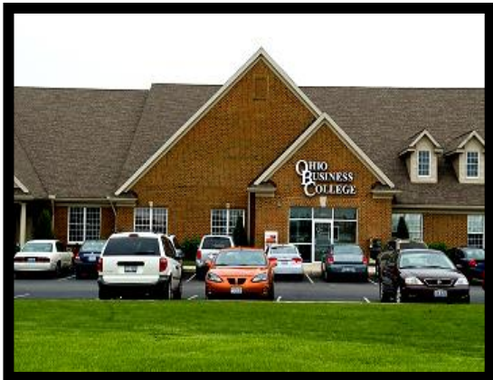
Sandusky (Branch Campus)