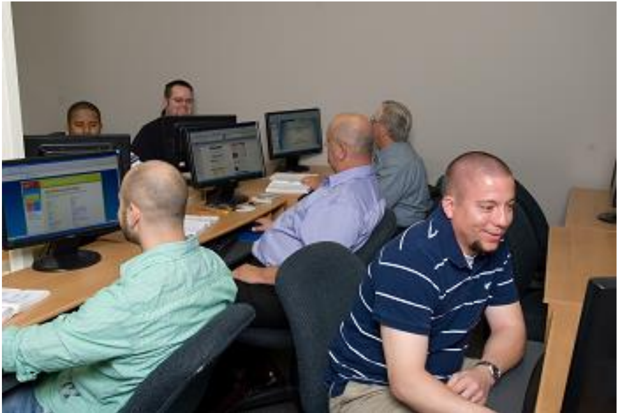
Sandusky (Branch Campus)