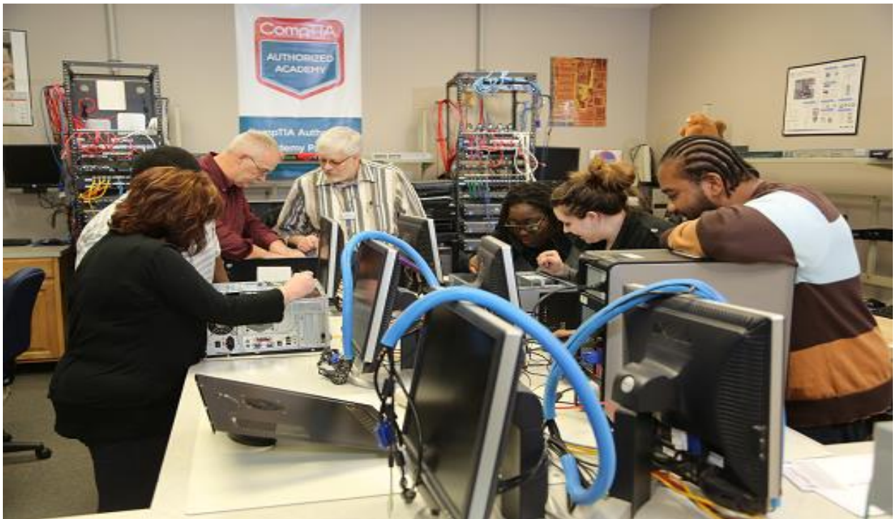
Sandusky (Branch Campus)