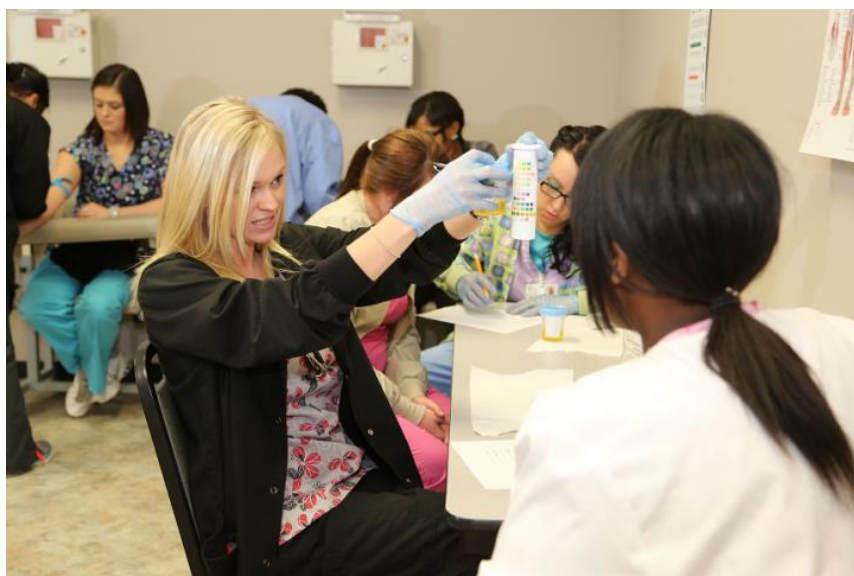
Sandusky (Branch Campus)

Career opportunities for successful graduates in the Medical Assisting Diploma program exist as entry-level medical assistants in front office as well as back office positions. Jobs would include: medical assistant, clinical assistant, administrative assistant, medical receptionist, and medical insurance biller.