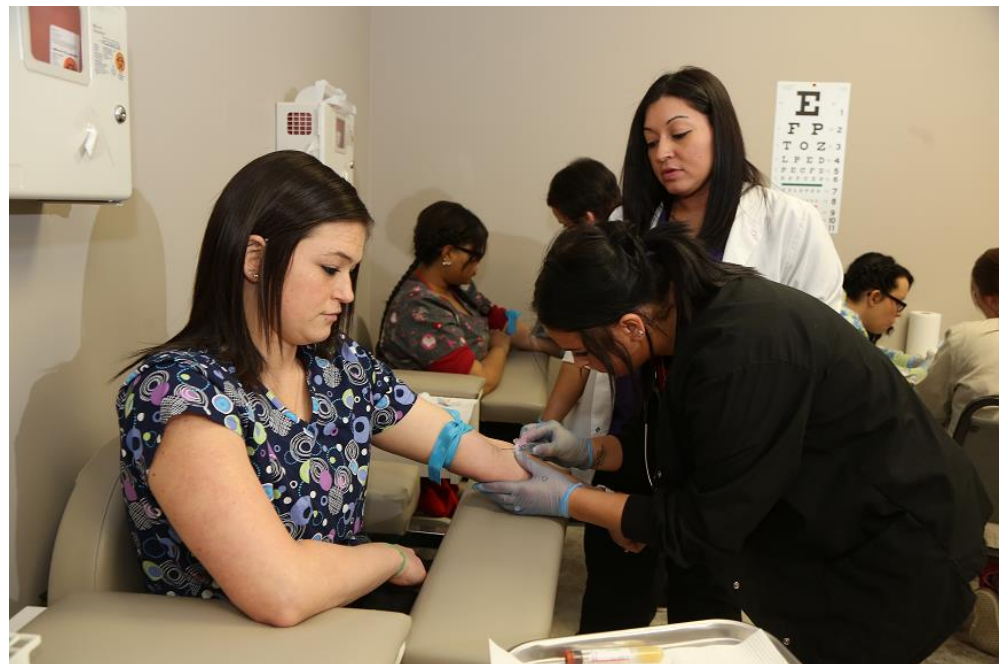
Sandusky (Branch Campus)