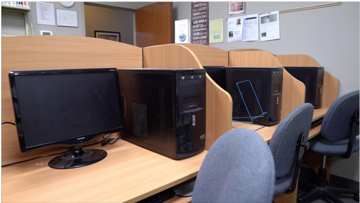
Sandusky (Branch Campus)