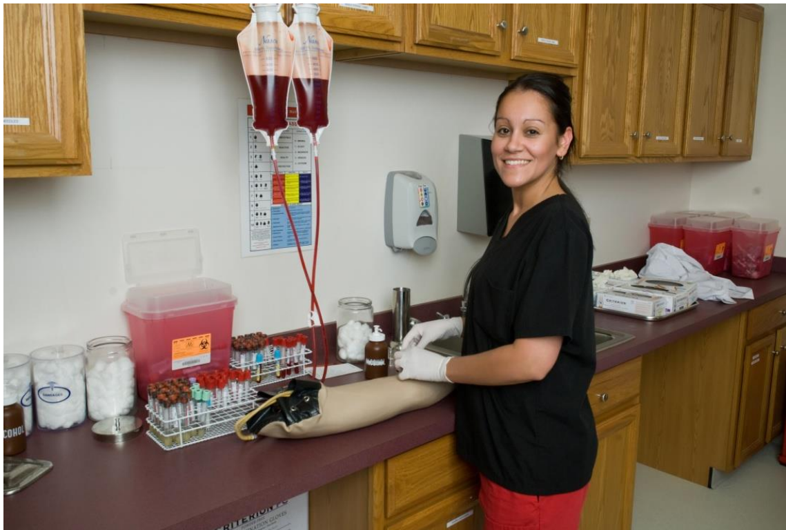
Sheffield Village Campus

Prerequisite: Successfully pass all parts of the Medical Assisting Program. Have completed the Hepatitis B series and finished their TB skin testing. Have obtained CPR Certification (Health Care Professional) and First Aid Training prior to progressing into externship.