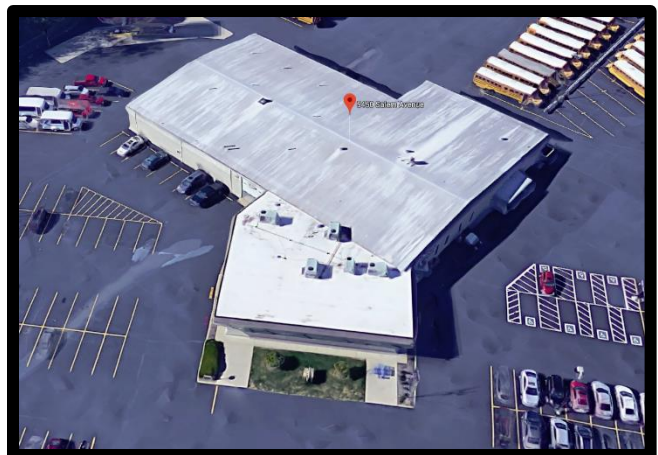
Truck Driving Academy (Branch Campus)